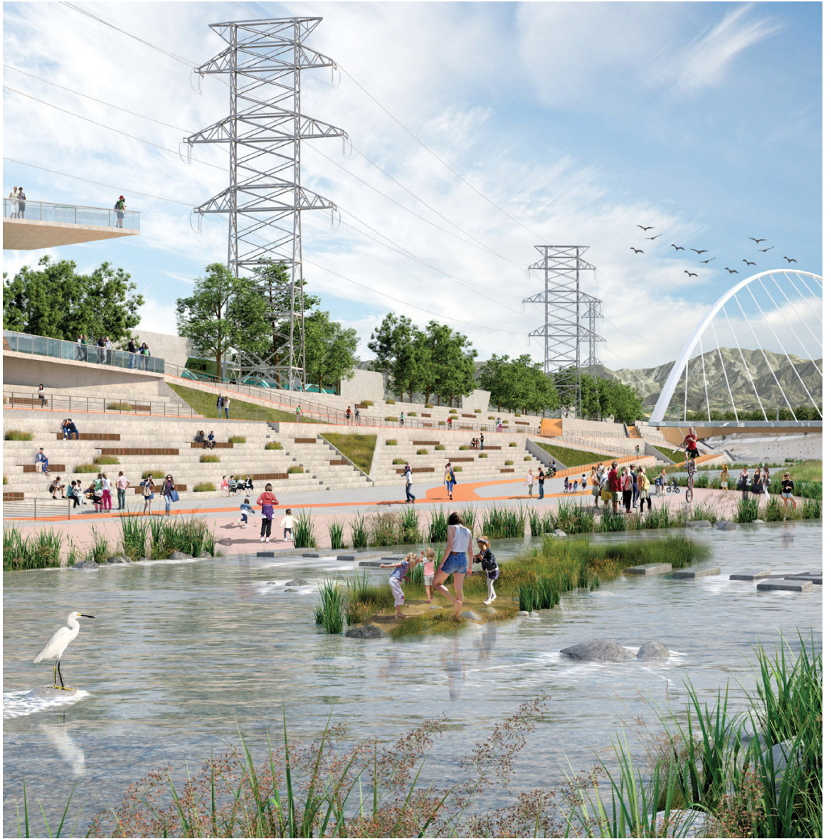
Architecture Firm CH2M's concept for a revitalized Los Angeles River