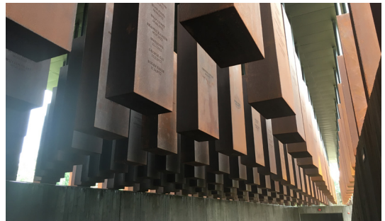
The National Memorial for Peace and Justice in Montgomery, Alabama