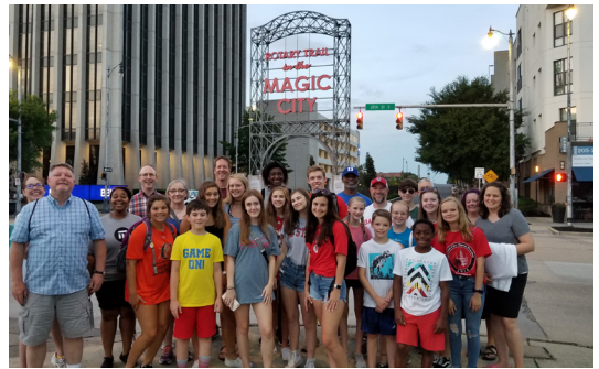
2019 Freedom Riders in Birmingham, Alabama

Cost is $500 and includes transportation, hotel, and meals.